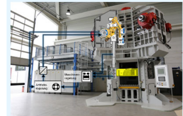
Figure 1: 3D Servo Press in the test halls of the PtU

More detailed information can be provided in a personal video conference.