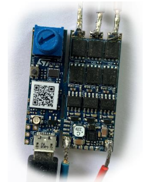
Fig. 2: Inverter with Controller